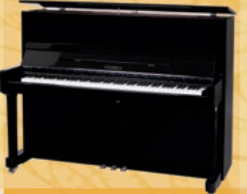
Mod. 122 - Universal