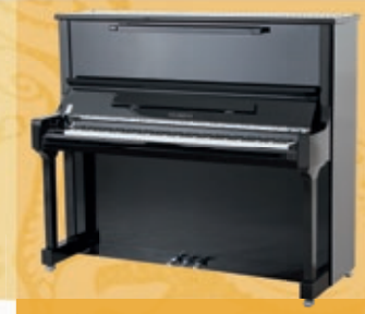
Mod. 133 - Concert