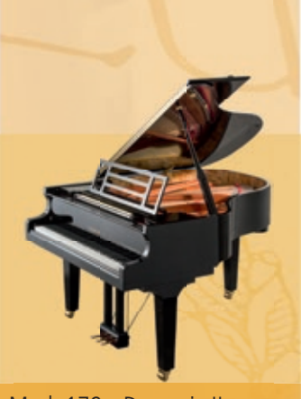
Mod. 179 - Dynamic II