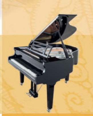
Mod. 162 - Dynamic I