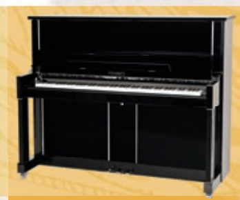
Mod. 125 - Design