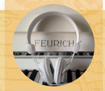
Silencer Systems for all models