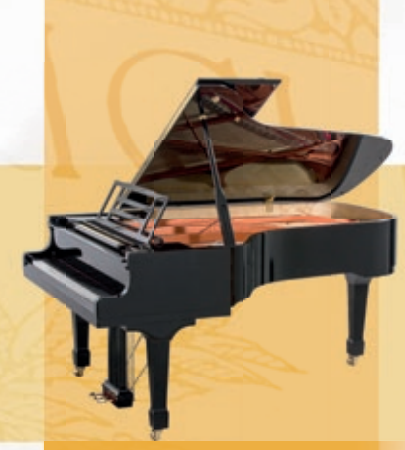
Mod. 218 - Concert I